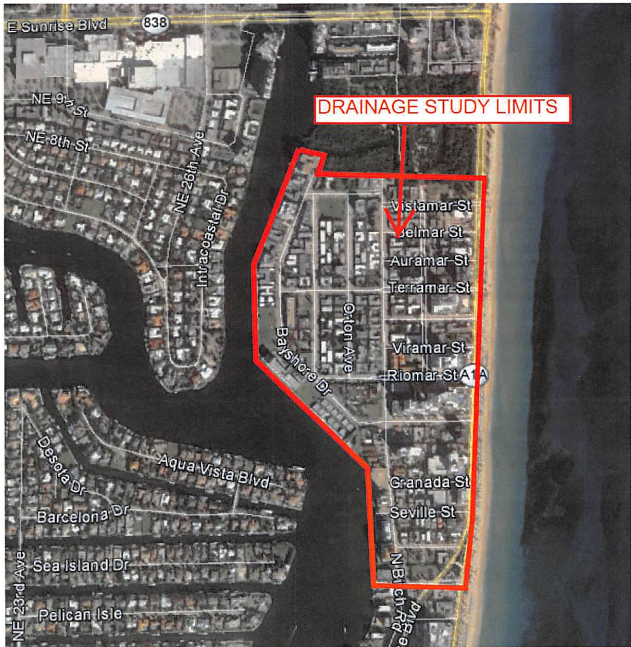
Exhibit 1 Location Map