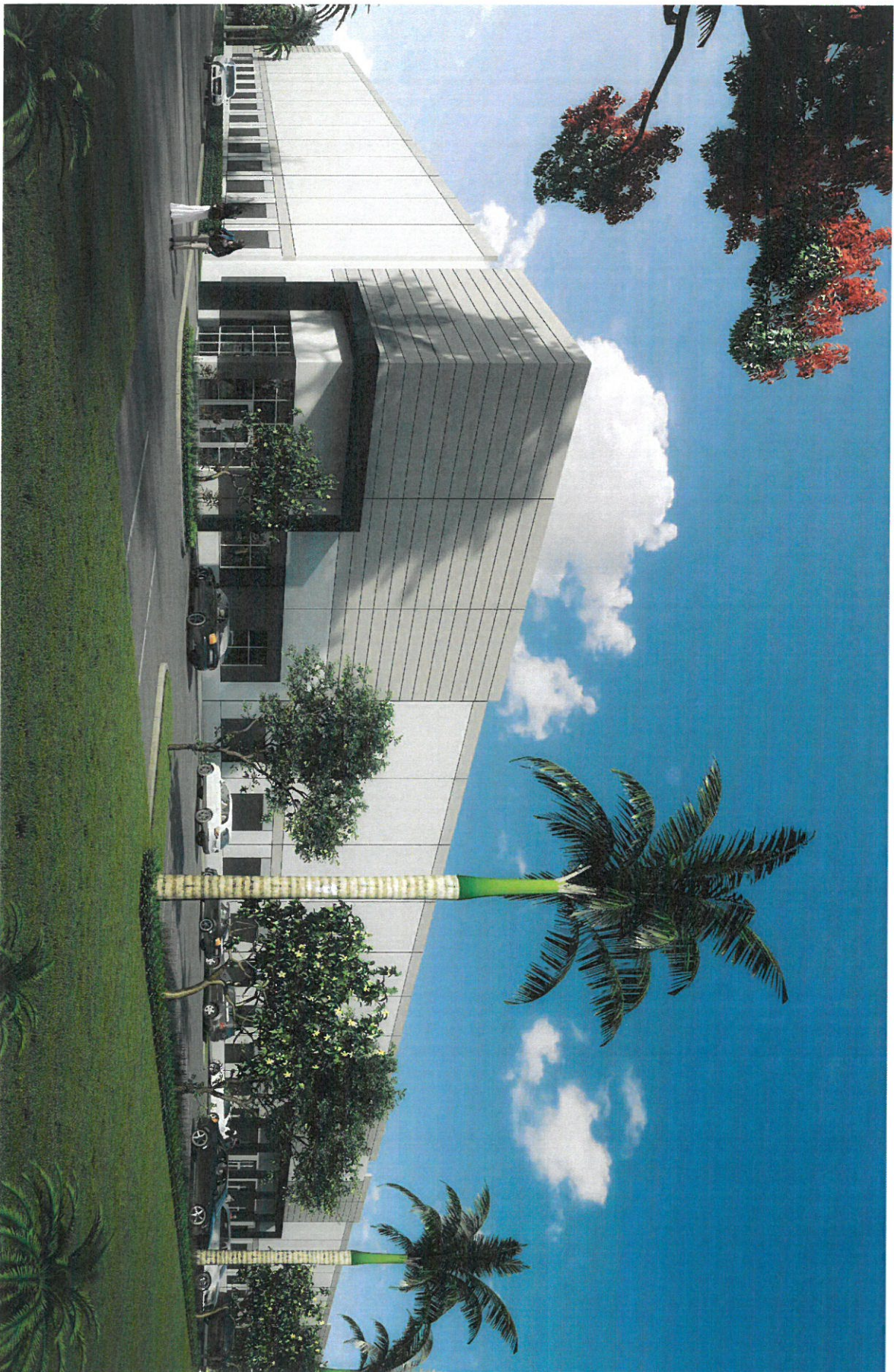
1 PERSPECTIVE - CORNER ENTRANCE FEATURE