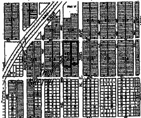
LOCATION SKETCH NOT TO SCALE