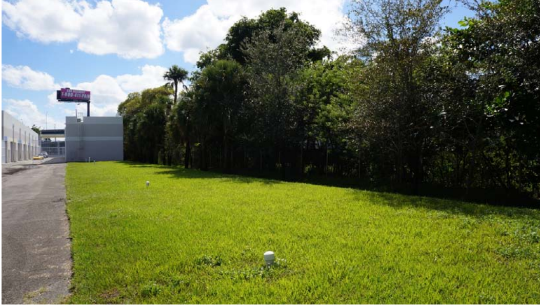
Landscaping – West Property Line