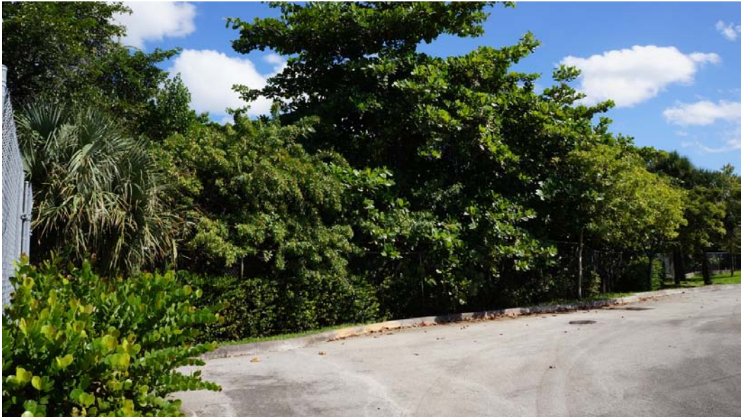
Landscaping – East Property Line