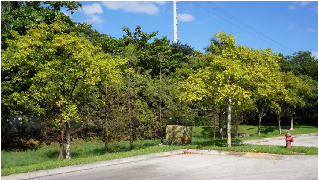
Landscaping – North Property Line