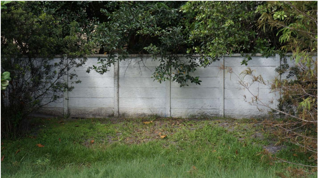
Barrier wall – North Property Line