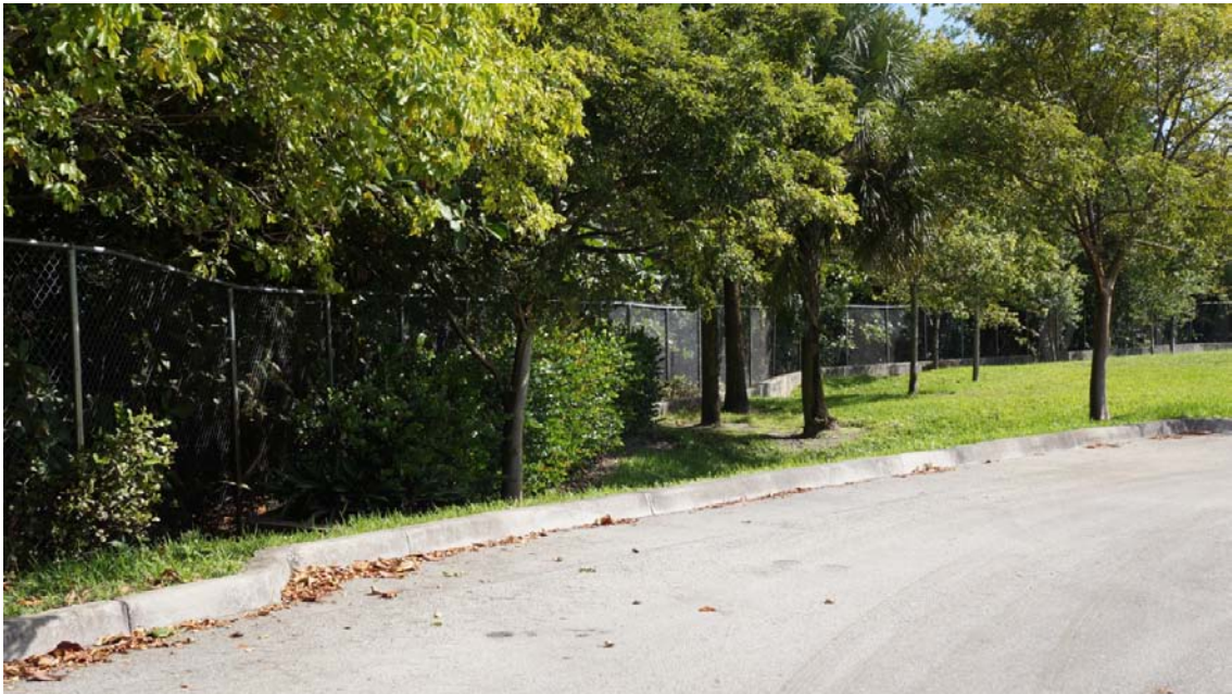
Landscaping – East Property Line